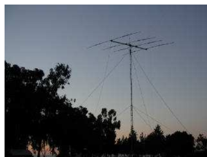
Antenna at Night