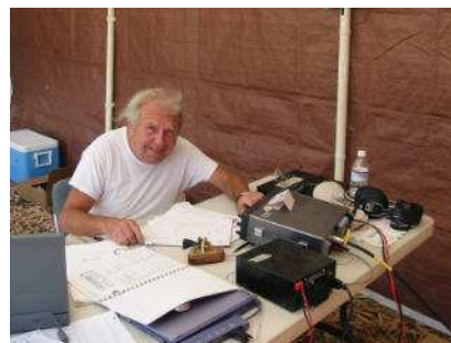
The CW Master